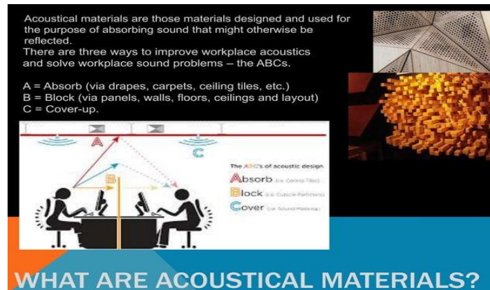
Figure 1 Showing the definition of Acoustic Materials

There are generally four types of Acoustic Materials in Construction. They include: