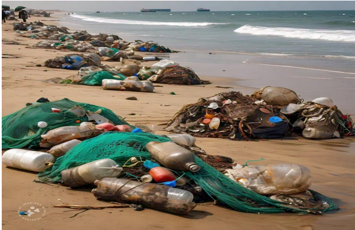
Fig.2 Typical sites from Bodo-Bonny waterway at ocean view; Sand fill sites

The effects of ocean waste on human life, livestock, animals, and fishes in the environment: