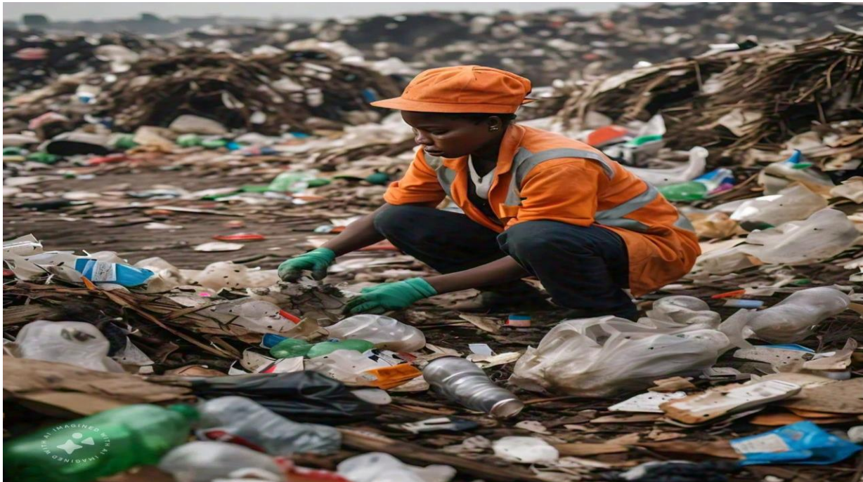
Fig 1. Typical dump site available in all Nigerian cities collaborated in Gokana LGA, Rivers state