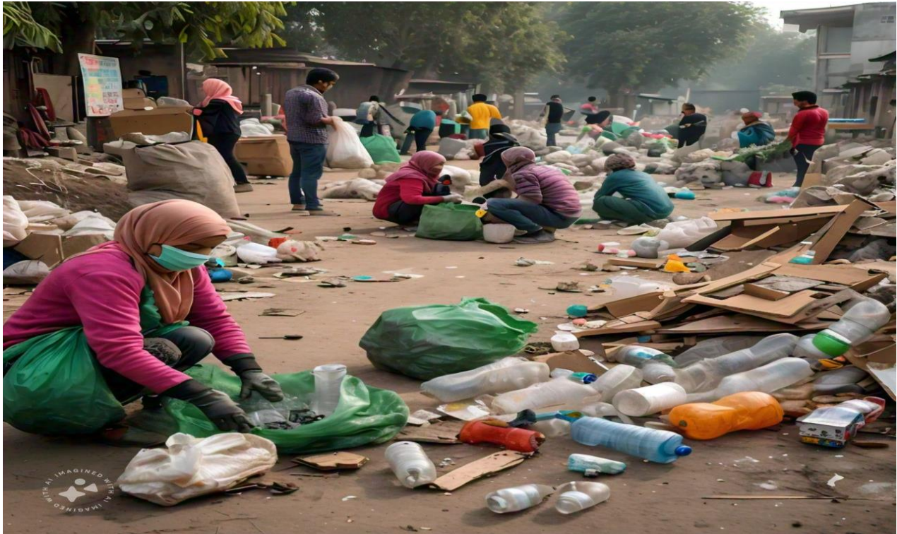
Fig 3. Open dump site in Pakistani/Indian cities depicting sorting of solid wastes.